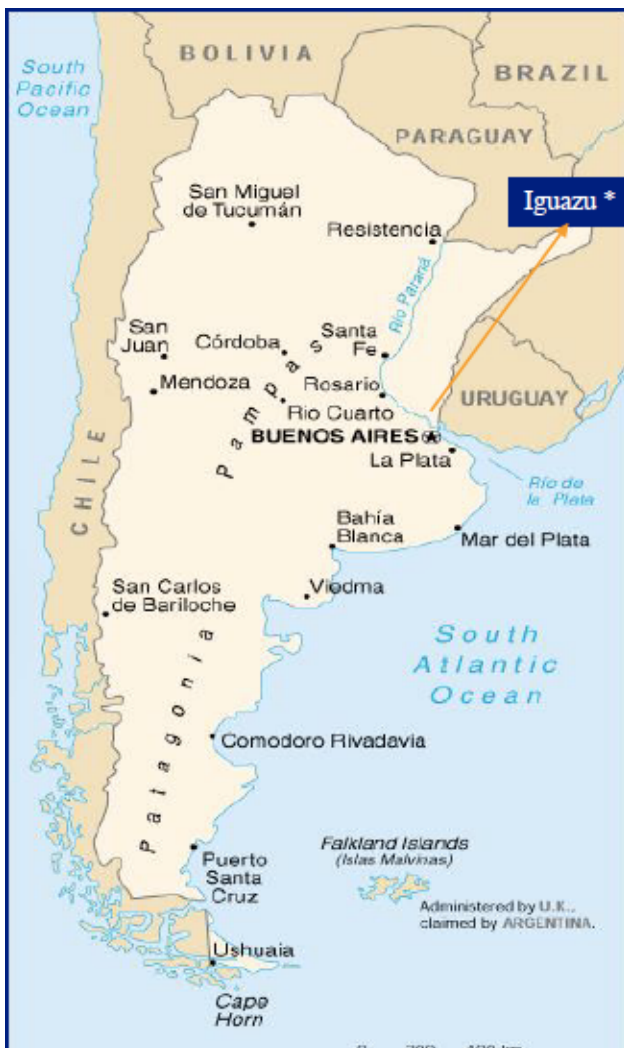
Buenos Aires – Iguazu: 1 hour, 45 mins.