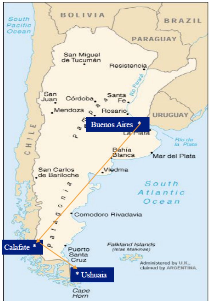
Ushuaia – Calafate: 1 hour 25 minutes